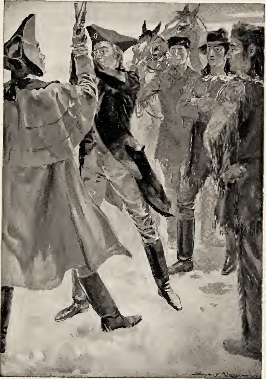
“THE PISTOL FLEW OUT OF TIPTON’S HAND.”